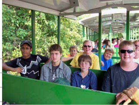
Everyone enjoyed our day at Kings Island.

regular givers, and the one-time gifts we received at the Sharing Banquet, we still need $45,000