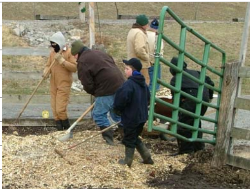
Students help get ready for a "A Country Christmas" at Marmon Valley Farm.