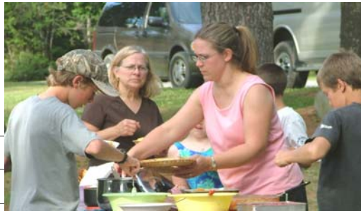
Potlucks at Family Camp are enjoyed by everyone.

The Bible warns us that in good times we soon forget Who gave us life and all the blessings we enjoy. We soon think what we have, we obtained on our own, putting ourselves in the place of God. This reminds me of the great warnings in Deuteronomy 6 and 11 where God