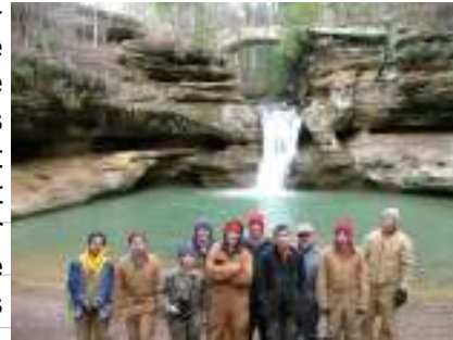
The guys learned a lot about respect & responsibility at beautiful Hocking Hills State Park

Growing in respect, responsibility, and relationships according to God's Word is not an option for the Christian, but a command to be followed. To do that, we must first realize that we have a strong desire to serve and glorify ourselves. We must then yield to the Christ who died in our place and gave us new life in Him.