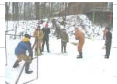
Broom Hockey was a big hit at the Wilderness Cabin.