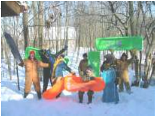
Sledding at the Wilderness Cabin was a favorite activity.