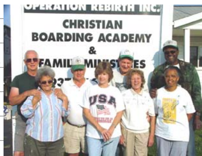
Mobile Missionary Assistance Program volunteers remodel our school.

Missionary Assistance Program are working in our academic building to make our space more efficient and give us the ability to serve more students. They have blessed us with their work and with their input into our students' and our lives. The building looks very good.